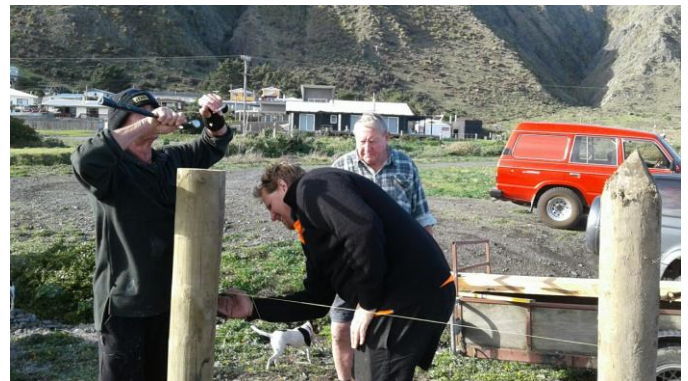
The Overseer ( Hands in Pockets )